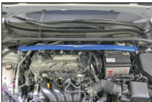
Illustration of installed state 安裝完成示意圖