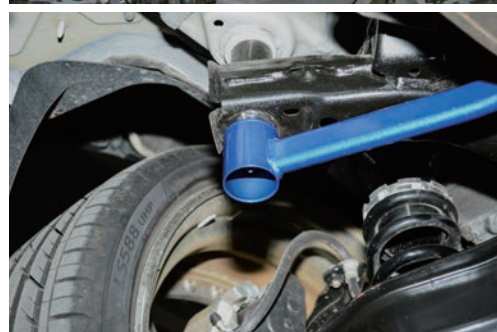
Illustration of installed state 安裝完成示意圖

將 ①結構桿桿身 組裝於車輛，並鎖上已拆下的原廠螺絲固定桿身。 (請參考圖表二、三)